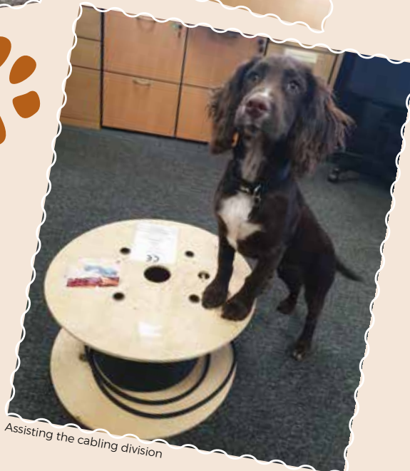
Assisting the cabling division