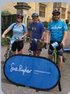
Nearly finished, a last stop at The Leckhampton Hospice