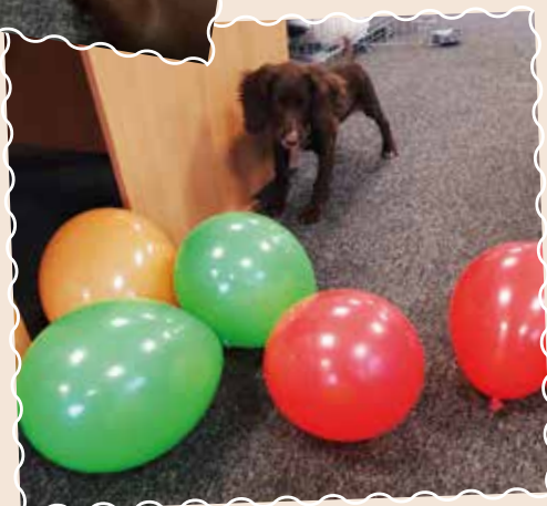
It's a party at Officeworx