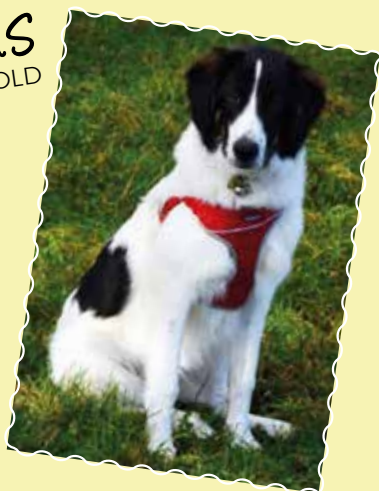
REMUS 15 MONTHS OLD

Romanian Shepherd Dog – he's looking for an adult only home in a rural location. He loves other dogs and they really help him with building his confidence. He is nervous of new people to start with but once he knows you he loves cuddles. Also loves playing with his snuffle matt filled with treats and playing in our sensory garden here at the Shelter.