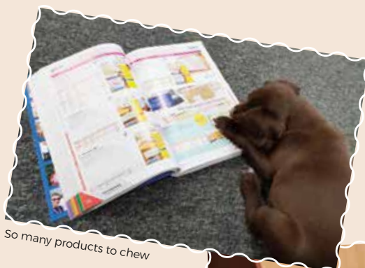
So many products to chew