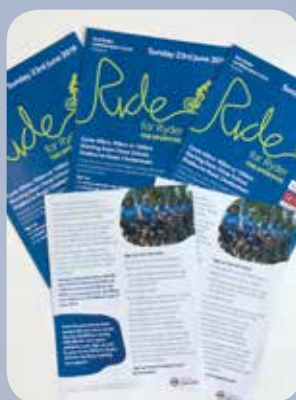
Can you spot the Officeworx Team?