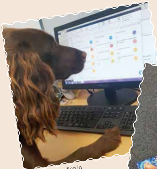
The orders are rolling in