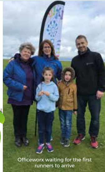
Officeworx waiting for the first runners to arrive