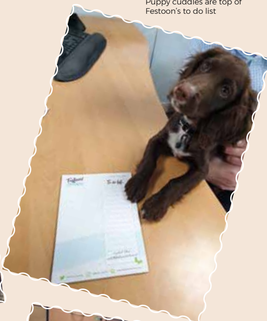
Puppy cuddles are top of Festoon's to do list