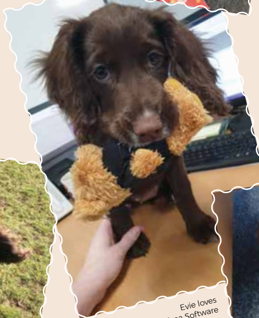
Evie loves Prima Software