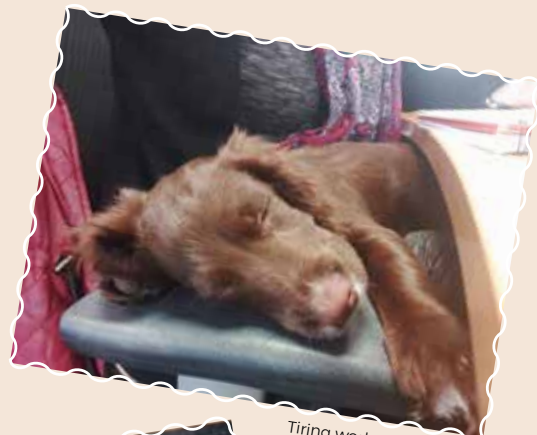
Tiring work at Officeworx